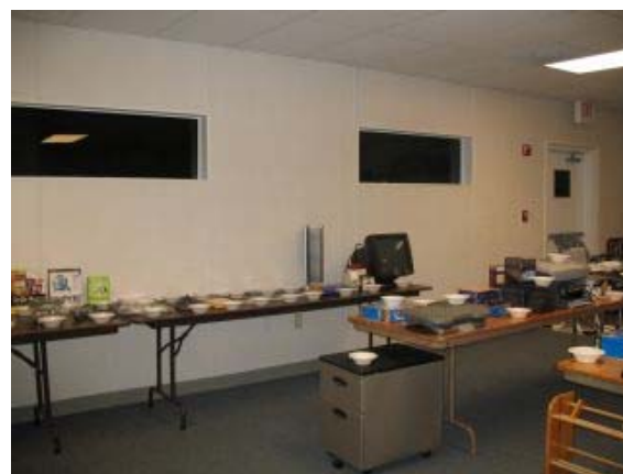
Some pictures of the auction.

Marie Vesta won third place in the “People and Children” category of the APCUG photo contest. This was nation wide and published on the www.apcug.net site under photo contest winners with photo. There were only two winners from the state of Florida.